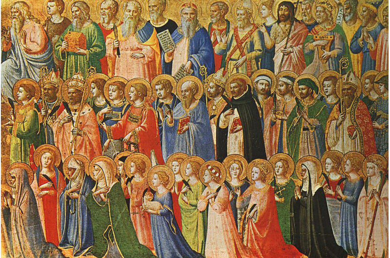
The Forerunners of Christ with Saints and Martyrs (c. 1423-24) - Fra Angelico (c. 1395-1455)